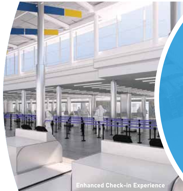
Enhanced Check-in Experience