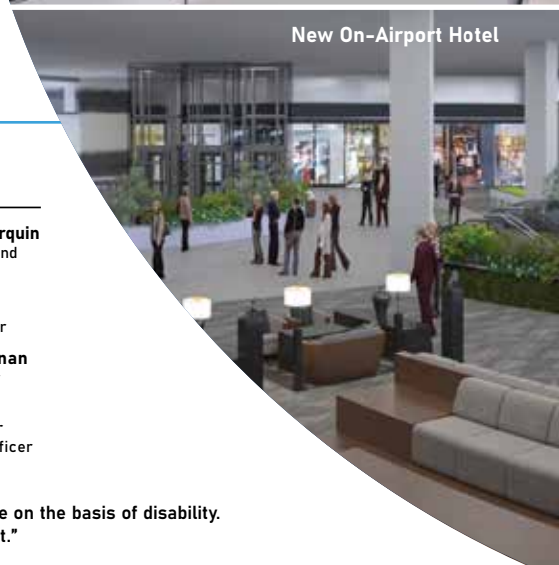
New On-Airport Hotel