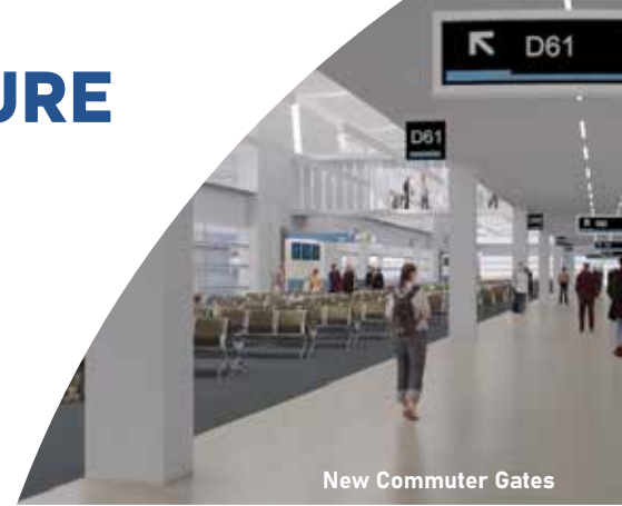
New Commuter Gates