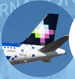
Volaris El Salvador San Salvador, El Salvador